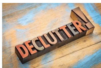
Decluttering Is There Only One Way