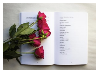
My Favourite Poem