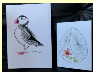
GREETINGS CARD, HAND SEWN WITH THREAD