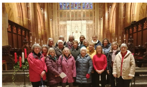
WI members from Gillingham Evening who enjoyed the Joyful Noise