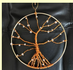
TREE OF LIFE CREATED ON A HOOP FROM WIRE AND BEADS