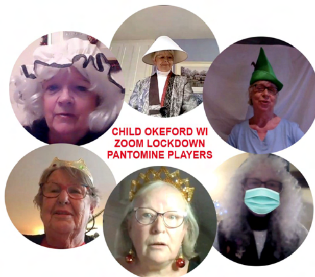
CHILD OKEFORD WI ZOOM LOCKDOWN PANTOMINE PLAYERS