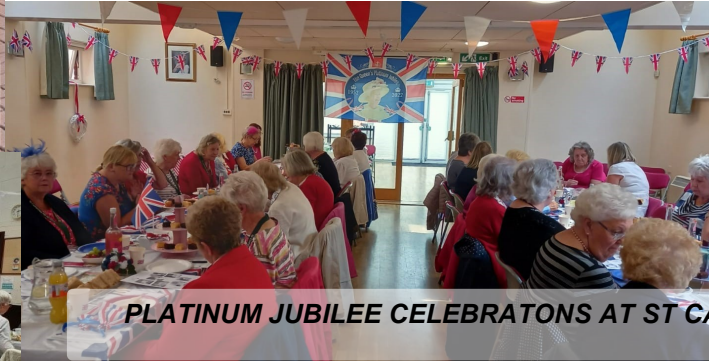
PLATINUM JUBILEE CELEBRATIONS AT ST CATHERINES HILL WI