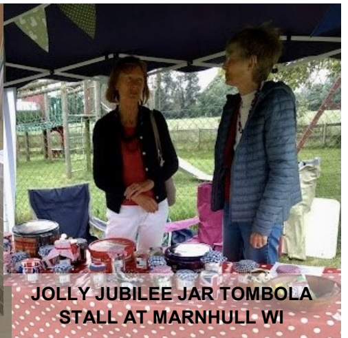
JOLLY JUBILEE JAR TOMBOLA STALL AT MARNHULL WI