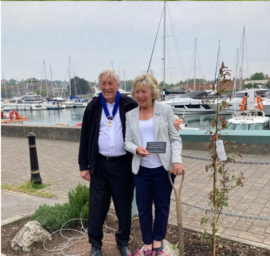
PLANT A TREE FOR THE JUBILEE AT WEYBAY WI