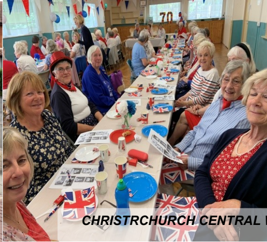
CHRISTRCHURCH CENTRAL WI PLATINUM JUBILEE PARTY