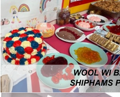
WOOL WI BACK TO THE 1950'S WITH SHIPHAMS PASTE AND BLANCMANGE