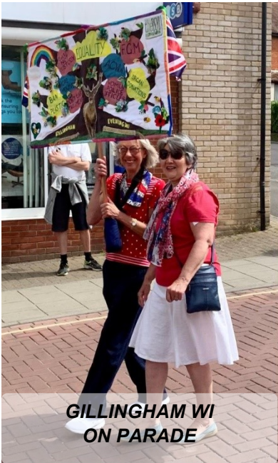
GILLINGHAM WI ON PARADE