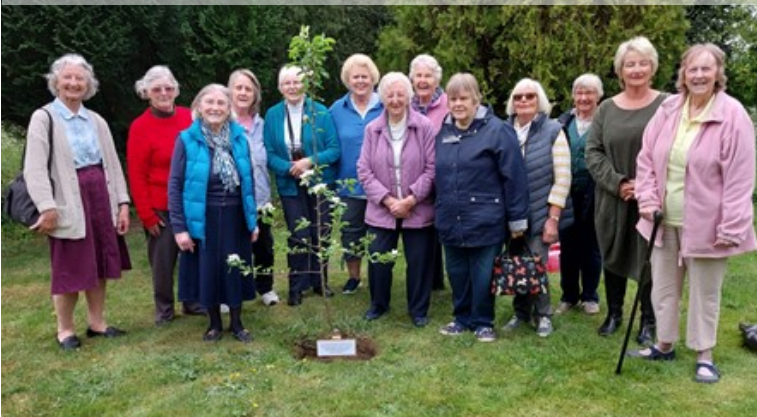
PLANT A TREE FOR THE JUBILEE AT SIXPENNY HANDLEY WI