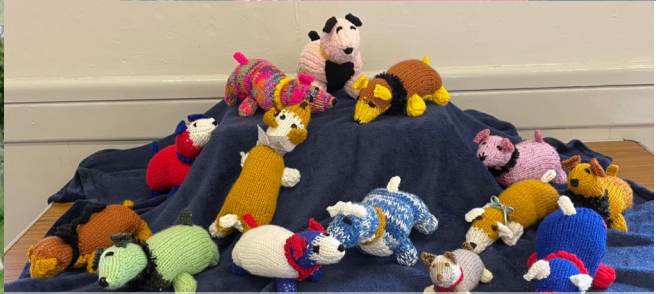
CORGIS FOR THE STREET PARTY AT WITCHAMPTON WI