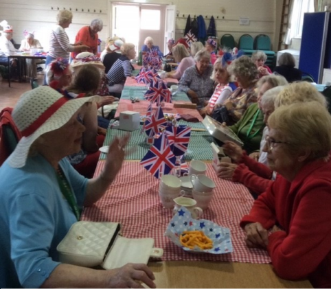
GRAND TEA PARTY AT LILLIPUT WI