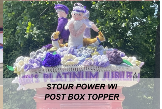
STOUR POWER WI POST BOX TOPPER