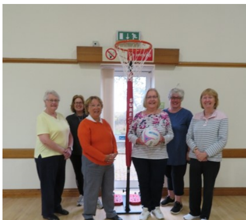
Members of Sandford and Wareham's Walking Netball Group,