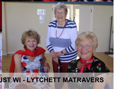
CELEBRATIONS AT NOT JUST WI - LYTCHETT MATRAVERS