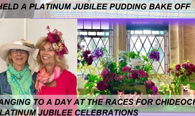
FROM FLOWER ARRANGING TO A DAY AT THE RACES FOR CHIDEOCK WIs PLATINUM JUBILEE CELEBRATIONS