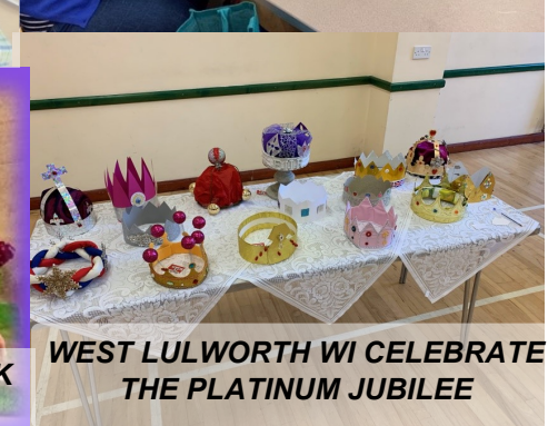
WEST LULWORTH WI CELEBRATE THE PLATINUM JUBILEE

Coming soon a digital edition of the CELEBRATION of the PLATINUM JUBILEE by WIs in DORSET containing all reports and photographs sent to the Dorset News.