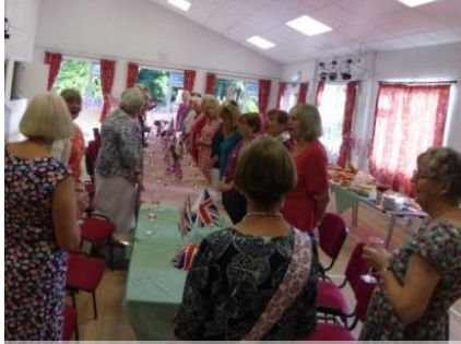
MARTINSTOWN WI HELD A PLATINUM JUBILEE PUDDING BAKE OFF