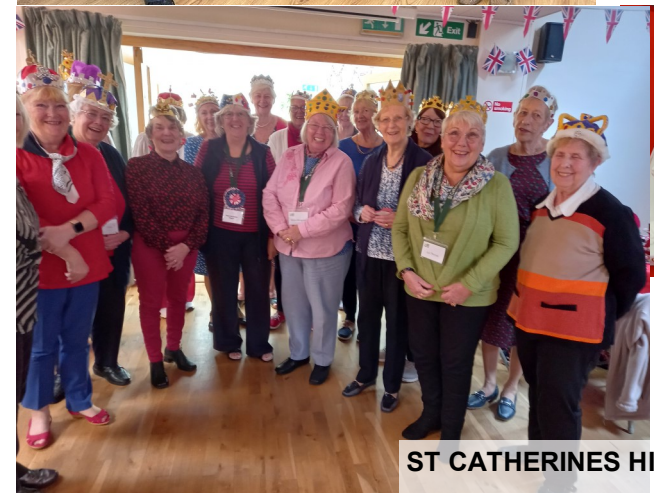
ST CATHERINES HILL WI