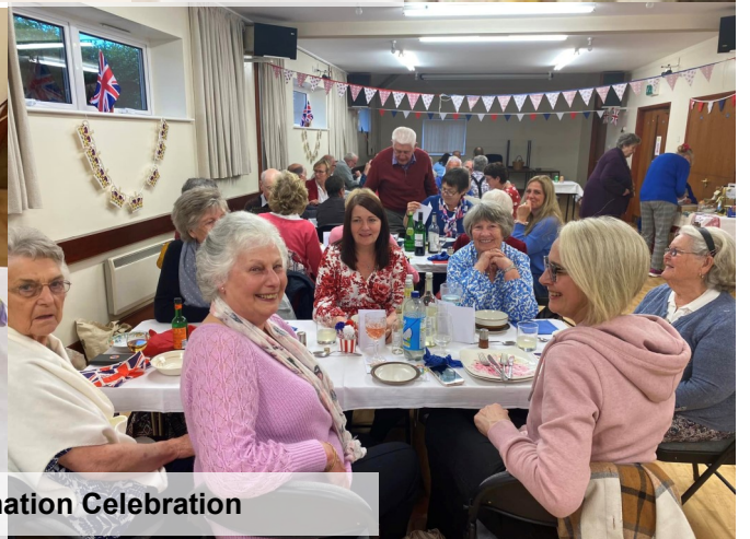
WOOL WI Coronation Celebration

Celebrating the coronation of King Charles III