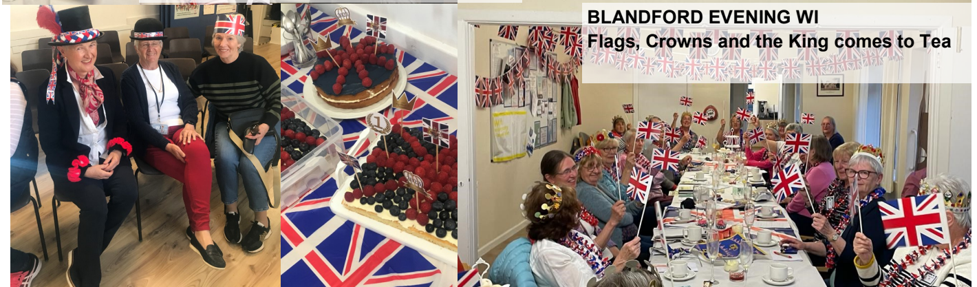
BLANDFORD EVENING WI