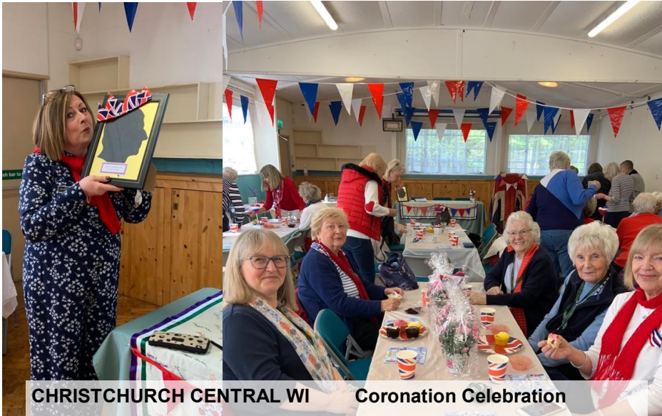
CHRISTCHURCH CENTRAL WI Coronation Celebration