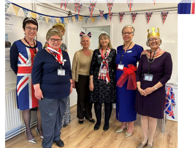
Coronation Celebration Party