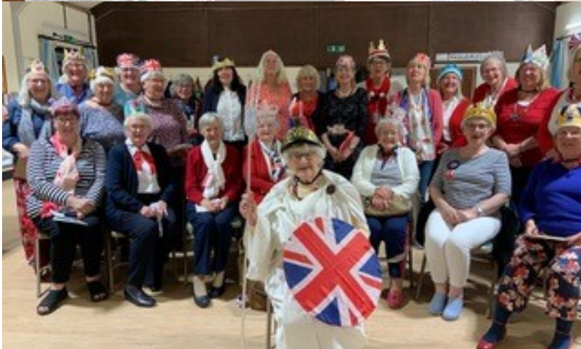
SANDFORD AND WAREHAM WI Rule Britannia