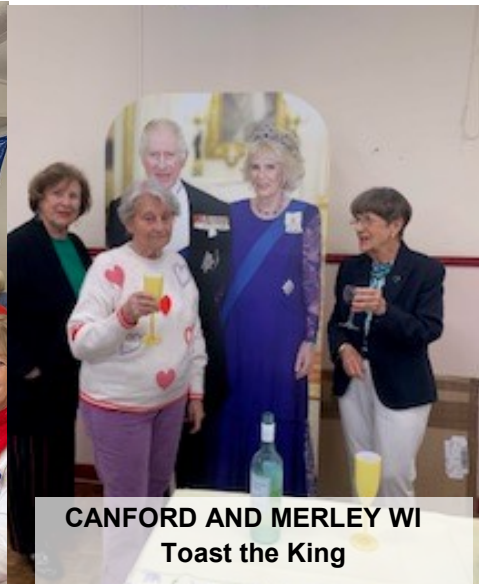
CANFORD AND MERLEY WI Toast the King