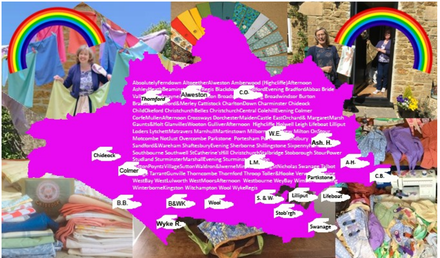
C.O.—Child Okeford; C.B.—Christchurch Belles; L.M.—Lychett Matraverse; S.&W.—Sandford and Wareham; Stob'rg'h—Stoborough A.H.—Amberwood Highcliffe; B.B.—Burton Bradstock; B&WK—Broadmayne & West Knighton; W.E.—Wimborne Evening; Ash.H—Ashley Heath; Wyke R.—Wyke Regis (see Page 7 for details)