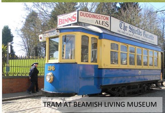
TRAM AT BEAMISH LIVING MUSEUM