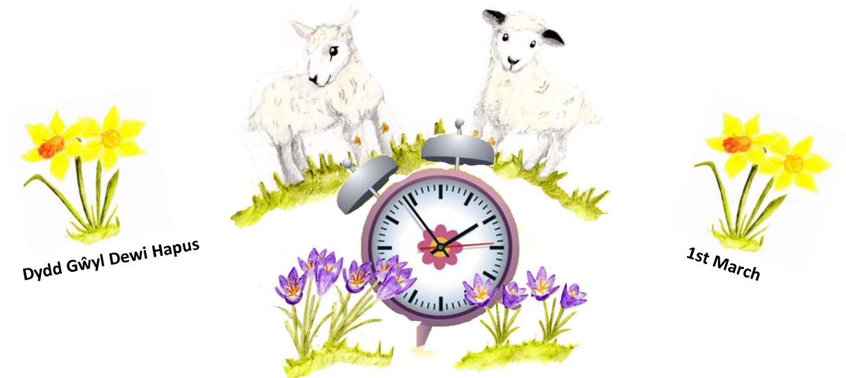
Dydd Gŵyl Dewi Hapus