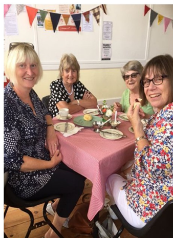
Members Tea Party