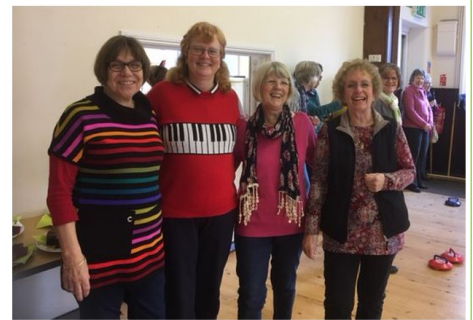
2020 Kurling Team