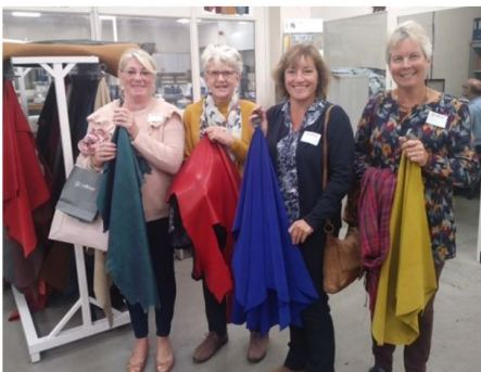
Pittards Leather Factory Visit

24 February is a special day for Marnhull as it is their 95th birthday. They recollect the fun of past meetings and look forward to celebrating when lockdown is over.