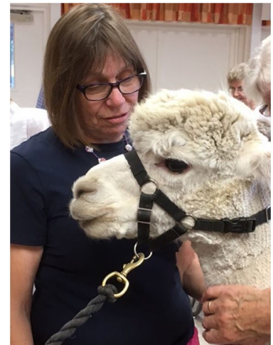
Our Aplaca meeting