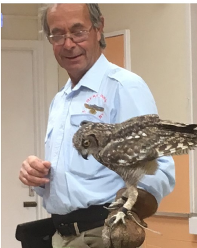
Visit from Mere Down Falconry