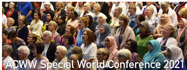
ACWW Special World Conference 2021