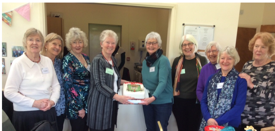
Past and current Presidents of Beaminster WI

On Monday, 21 February over 40 members of Beaminster WI were finally able to get together for a tea party to celebrate their 104th year. Even the sun shone on this February afternoon. It was brilliant to get together for a cream tea, a catch up and an amazing 104th Birthday Cake. It had been so long since the members had been able to gather in person and have a good old chat.