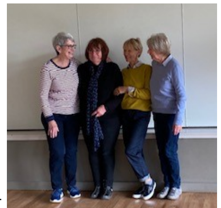
THE WINNING TEAM - PORTESHAM

Perhaps you will be able to drum up some support from your WI and get a team together for next year's League? I hope so.