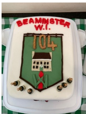
Our amazing cake