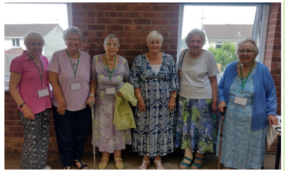
Past Presidents of Stalbridge WI